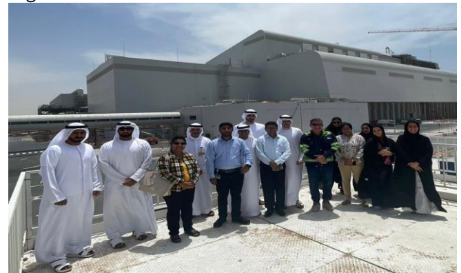
Members of the ENOC HSE team with the DWMC HSE manager For more information about the DWMC project, to request information or to raise a grievance please email us at info@dwmc.ae .