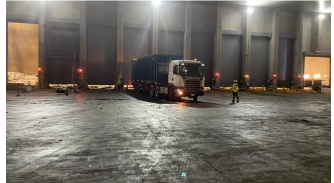
A bulk ejector vehicle maneuvers on the tipping floor during nighttime operations

heavy lift crane was dismantled and removed from site this month, signifying the completion of all heavy lifting activities. The remaining high level construction work in block 2 involves panel fitting works, which are carried out using smaller cranes and MEWPS.